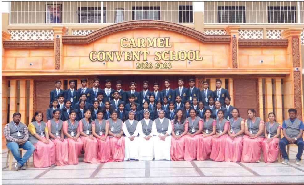
CLASS X - A - ICSE