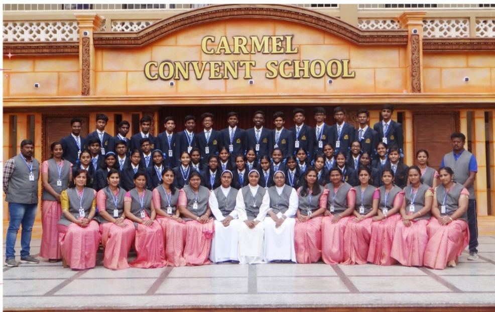
CLASS X - B - ICSE