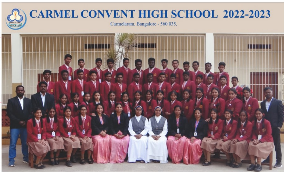
CLASS X - A - STATE